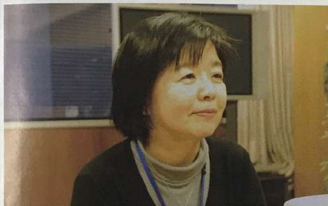
Nozomi Tsuji is spokesman of JNTO, an independent administrative institution of the Ministry of Land, Infrastructure, Transport and Tourism

JNTO spokesman Nozomi Tsuji said, "Taiwanese tourists were quick to come back. Taiwan people were also the largest donors. With Taiwanese show biz stars holding concerts supporting Japan and friendly exchanges held immediately after the quake, and other efforts in the