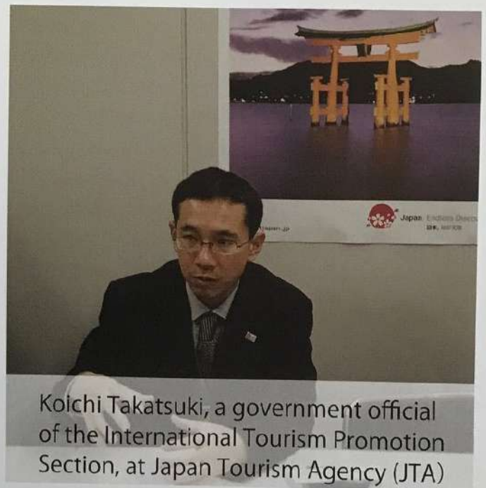
Koichi Takatsuki, a government official of the International Tourism Promotion Section, at Japan Tourism Agency (JTA)

Koichi Takatsuki, a government official of the International Tourism Promotion Section, at Japan Tourism Agency (JTA), said foreign governments issued advice to stop or cancel visits to Japan following the disaster, triggering a series